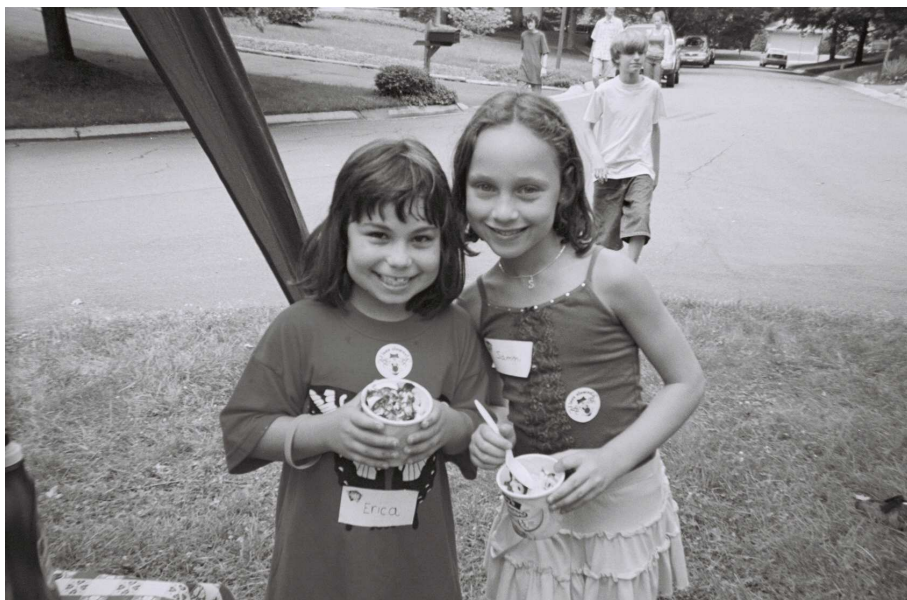
Girls enjoying their sundaes at the 2 nd annual FGHOA Ice Cream Social

Last year, we used a local ice cream parlor for our social and were very pleased with the results, but we would love to try your ice cream this year, instead. Regardless of whether or not we are chosen as one of the package winners, though, we will still hold our neighborhood ice cream party this summer to promote a sense of community, and we applaud your efforts to do the same!"